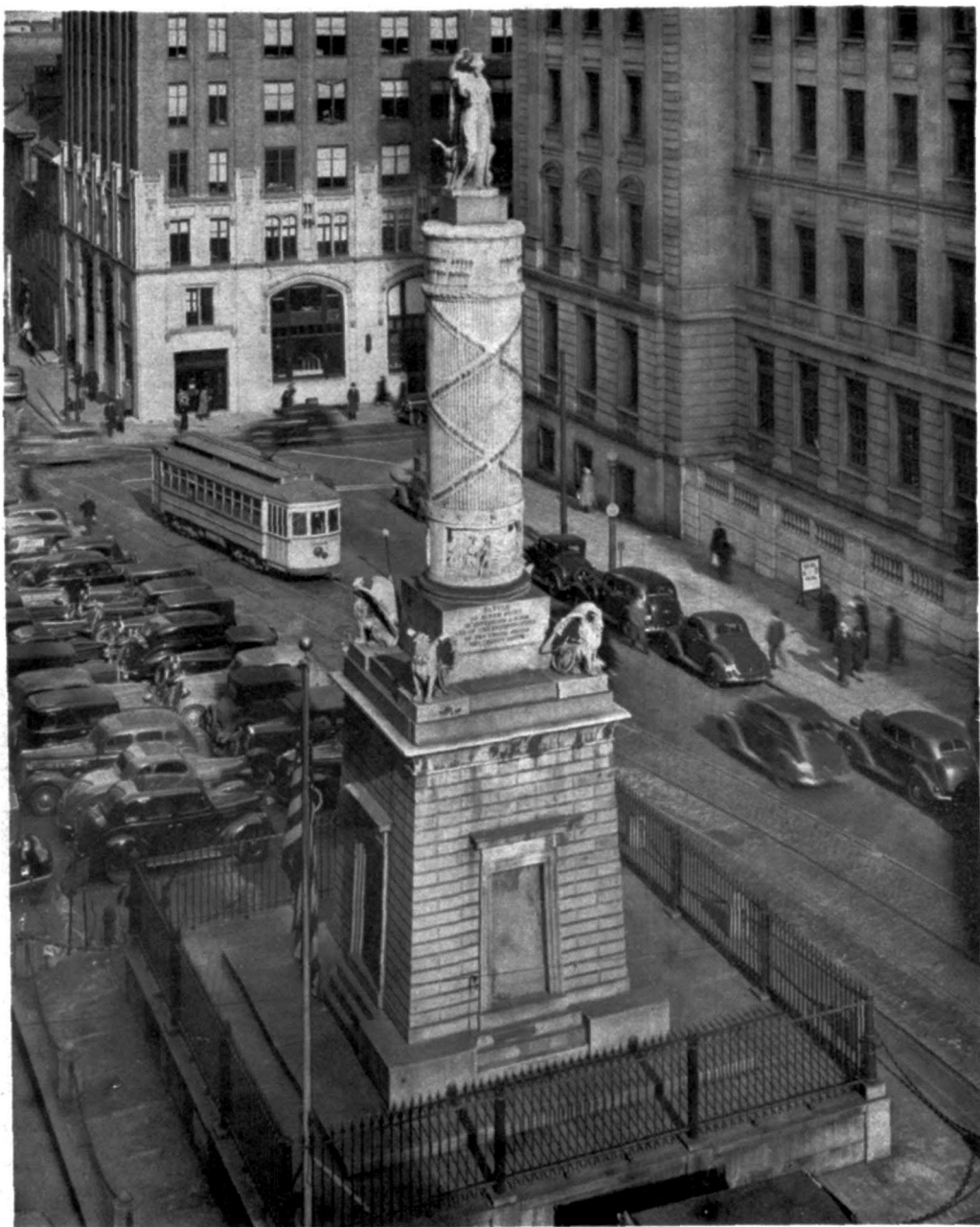
A striking memorial to commemorate the Battle of North Point, fought during the War of 1812. Baltimore militia repulsed invading forces and turned the tide of the war.