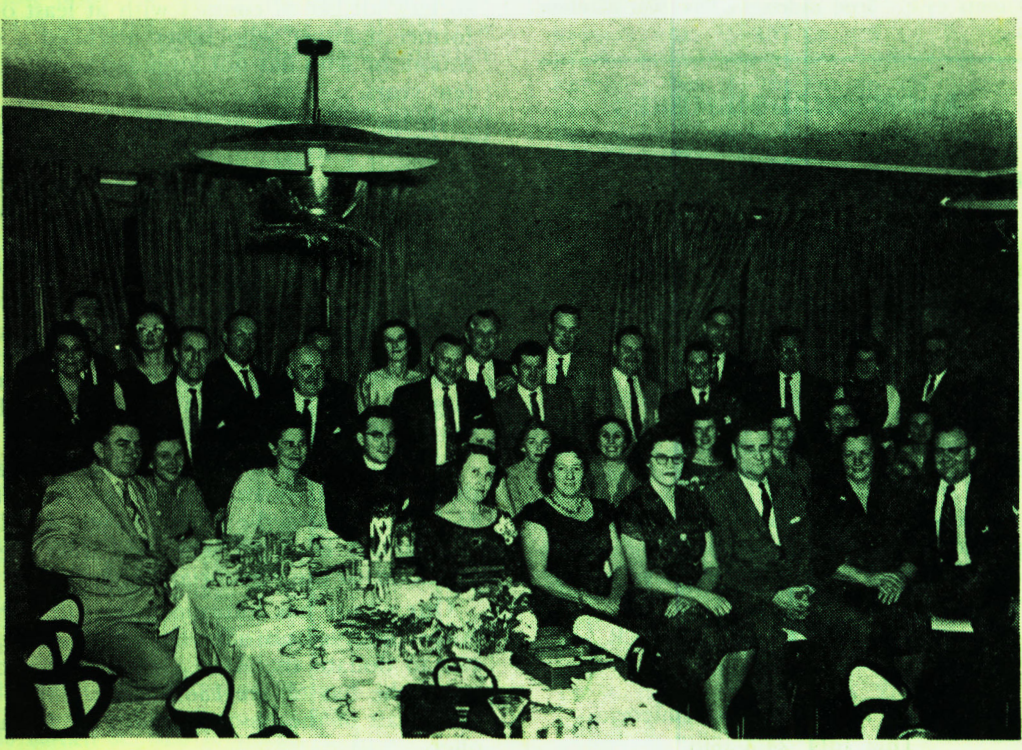
Bulge Day Dinner - New Jersey Group

★ NORTHERN FRANCE ★ THE ARDENNES ★ THE RHINELAND ★ CENTRAL EUROPE