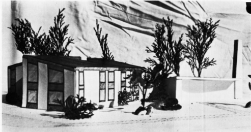
Addition to our memorial