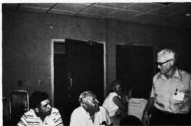
Above photos were taken at last reunion by our late chaplain.