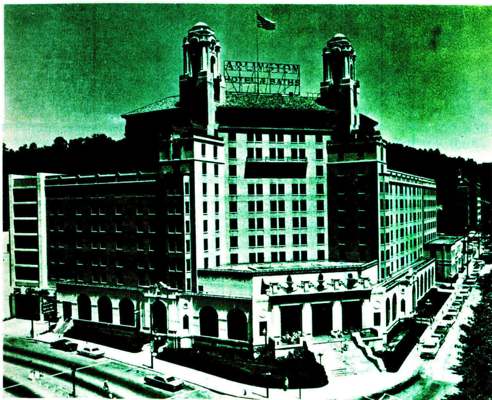
HOT SPRINGS JULY 17 -20