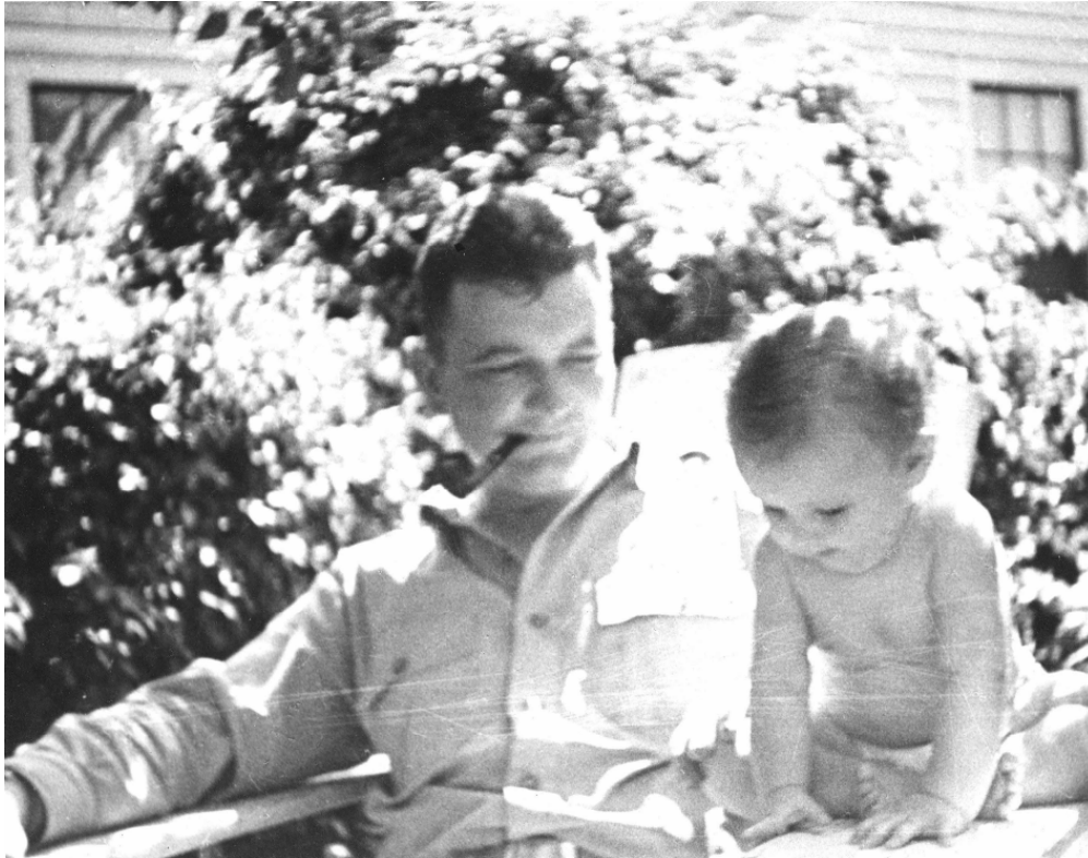
This picture of Dad and me in Indiana is my favorite. Mom and I moved back to Pennsylvania in September 1944