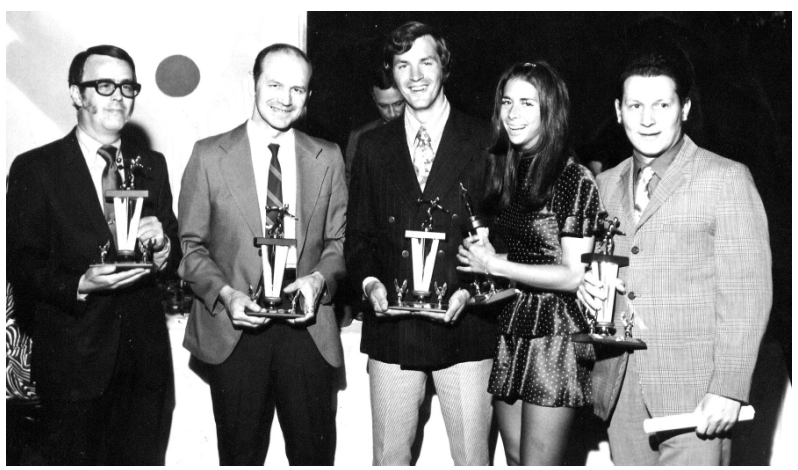
NBC Bowling Team - 1971