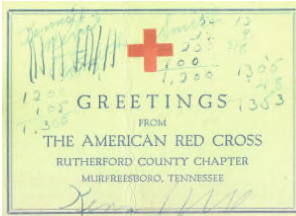
Dates to Remember

DATES TO REMEMBER OCT 8 CAMP ATTERBURY, I.D. OCT 10 MYLES STANDISH, MASS. OCT 14 NEW YORK (SAILING) OCT 22 SCOTLAND OCT 24 ENGLAND (TODINGTON) NOV 21 SOUTHAMPTON DEC 5 LE HAVRE (FRANCE) DEC 9 BELGIUM (BORNI) DEC 14 ARDENN WOODS (BATTLES) DEC 17 CAPTURED. DEC 23 BOMBING IN BOX CAR DEC 25 BAB-ON-BERMAN X XMAS DAY 1944 DATE LIBERATION DAY APRIL 7, 1945 8:27 TPO DATES 2 SPALARA Box 66 HARWICK, PA. Rafert Leafing 4737m. 2525 30.6 21 St Louisville Ky.