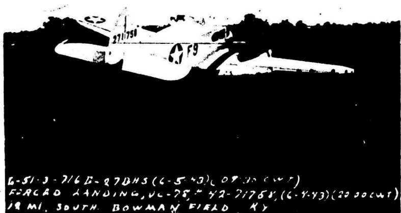
6-51-3-716B-270NS (6-5-43) (07:30 CWT) FORCED LANDING, VC-78, # 42-71758, (6-4-43) (20 00 CWT) 12 MI. SOUTH BOWMAN FIELD, NY