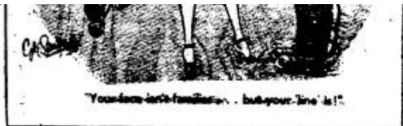
"You're not familiar... but your line is!"