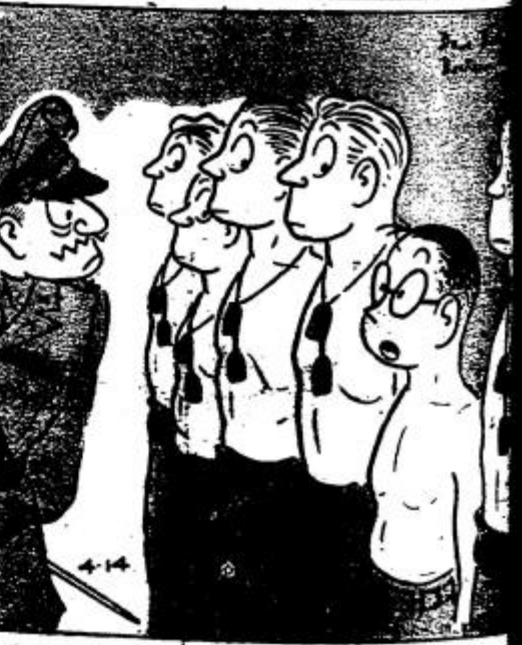
"I sent my identification tags home, Sir, where they can be safe."