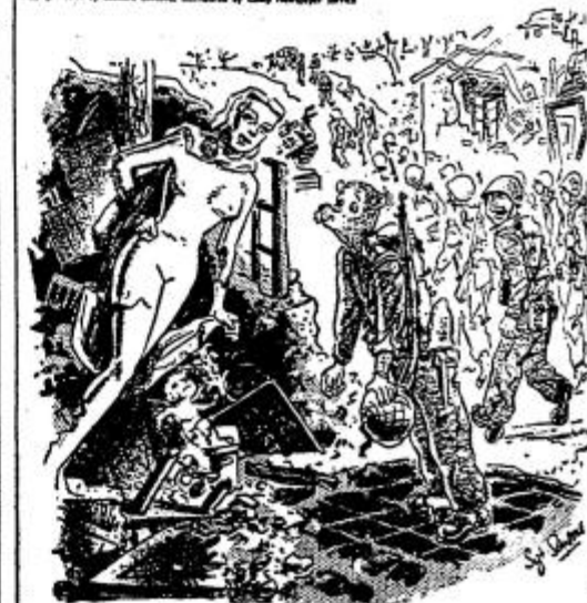
"Hey you! FALL IN!"