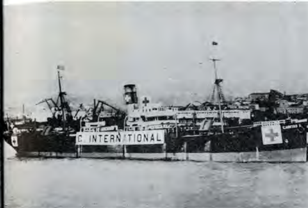
Red Cross ship Caritas I at a European Port.

to agree to the transfer to Swiss registry, for Red Cross purposes, of ships which hitherto had sailed under belligerent registry. The result of this has been the setting up of a new organization for the purpose of operating such ships. This is the Swiss Foundation for Red Cross Transports, incorporated in Switzerland under Red Cross auspices and announced officially on April 23, 1942. The Caritas I , the first boat acquired by the Foundation, has just completed her second voyage direct from Philadelphia to Marseille, entirely laden with American Red Cross supplies. She is the first prisoner of war relief ship to sail from the country of one belligerent to territory occupied by an enemy belligerent.