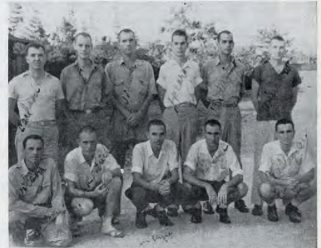
American prisoners of war at Zentsuji. This group includes five aviators from the U. S. S. Houston

Sports space is provided for baseball, cricket, and deck tennis, with a "gymnastic excursion" outside the camp once a week. Radio is available, for local reception, and a library of some 500 books was obtained from