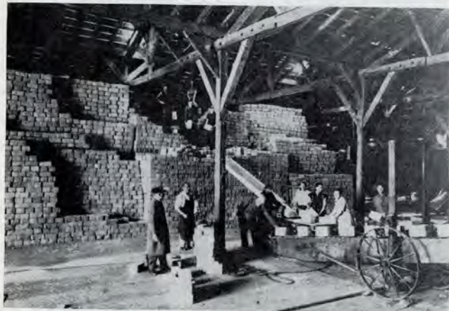
Prisoner of war relief packages leave International Red Cross Committee Warehouse in Switzerland for Axis prison camp.

"I had grown fond of the desert," said Peter. "It sort of grows on you;