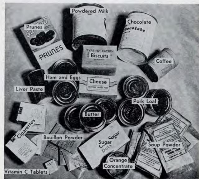
Contents of the invalid food parcel packed by Red Cross volunteers in the New York Packing Center. This parcel is for prisoners recovering from illness or wounds.

Cotton, absorbent, USP, 1/4 lb. pkg. 1 pkg. Phemerol topical (mild germicide), 1 oz. 2 pkgs. Dressing, gauze, 3"x3", sterile, in envelope 50 envelopes Adhesive, USP, 3"x5 yds. 1 roll Readi-bandages, 1"x3", 100 in box 1 box Pins, safety, assorted sizes 3 cards or 3 doz. Aspirin, tablets, 5 grains, 500 in carton 1 carton Soda, bicarbonate, USP, 5 grain tablets 1 pkg. Cathartic, compound, pills, NF VI, 500 in carton 2 cartons