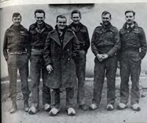
American "veterans" at Stalag Luft III. The wooden shoes worn by these flyers were issued by the German authorities. Many prisoners are said to prefer wooden to leather shoes for winter wear.

(Note: Many of the Japanese "camps" in industrial areas appear to be merely barracks or buildings used for housing prisoners of war rather than encampments. Ed.)