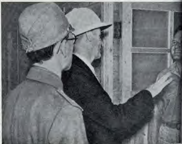
Under Japanese escort, the Shanghai Delegate of the International Red Cross Committee visits prisoner of war camps.