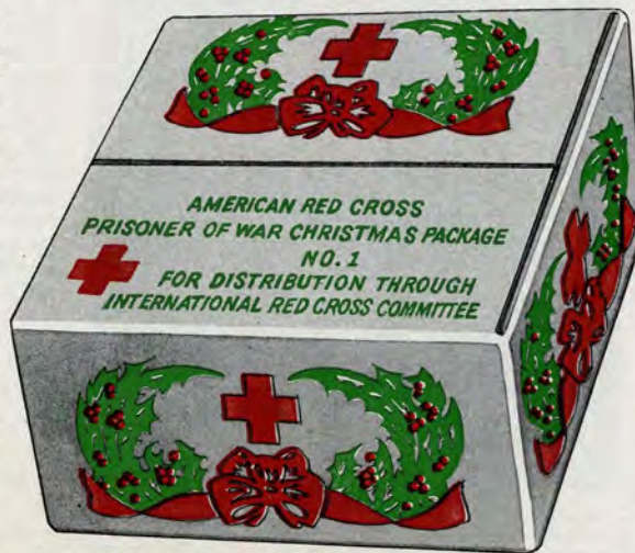
Ten thousand of these special packages were shipped to Europe for distribution to American prisoners at Christmas.

These Gripsholm supplies, which were transferred to a Japanese ship at Morogao under International Red Cross Committee supervision, were unloaded during November at the designated points in the Far East. Assuming no undue delays have occurred, there has thus been ample time for the food, clothing, medicines, and other supplies to reach the men in the Far East camps by Christmas.