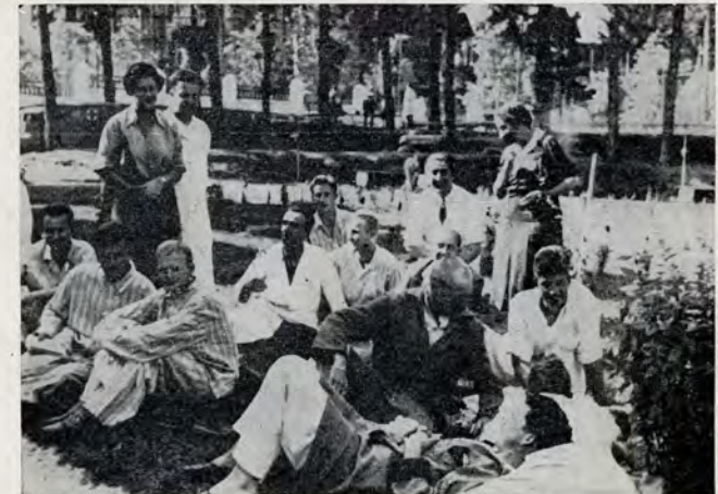
Convalescing American flyers, with International Red Cross delegate and Rumanian Red Cross nurses, in the hospital grounds at Sinaia.