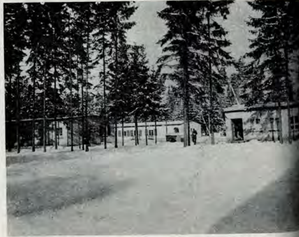
A German prison camp in winter—Stalag VIII B. This is mainly a British camp but it contains American prisoners.

Like the British, the Americans in this camp are said to be eager for the opportunity to take examinations, and are anxiously awaiting university and high school programs. "On the whole," the report concludes, "the Americans are rather well here, and I have not heard any