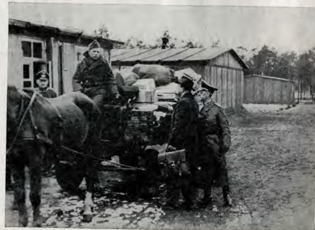
International Committee Delegate and German camp authorities watch arrival of mail and parcels for American prisoners at Stalag III B (February 1944).