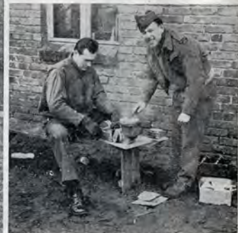
Outdoor cooking in the base camp at Furstenberg.