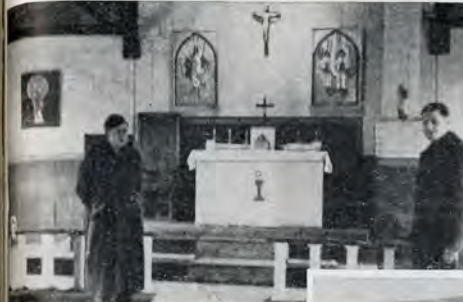
Camp chapel, built by American prisoners. Left, Catholic priest. Right, enlisted man who serves as Protestant chaplain.)

These pictures were taken on February 28-29, 1944, by a Delegate of the International Committee of the Red Cross)