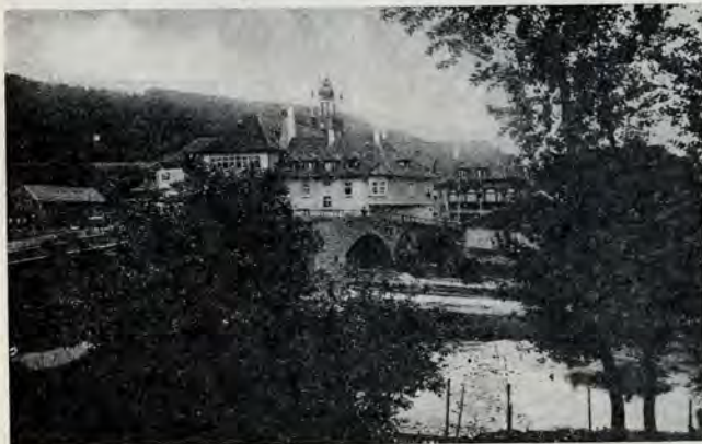
Reserve Lazaret, Obermassfeld, dependent on Stalag IX C at Bad Sulza in central Germany. A delegate of the International Committee of the Red Cross, who visited Obermassfeld in March 1944, reported by cable that the lazaret contained nearly 200 sick or wounded American prisoners of war (including 120 officers) and over 300 British.

Information regarding cable service to the Far East may be obtained from Red Cross chapters.