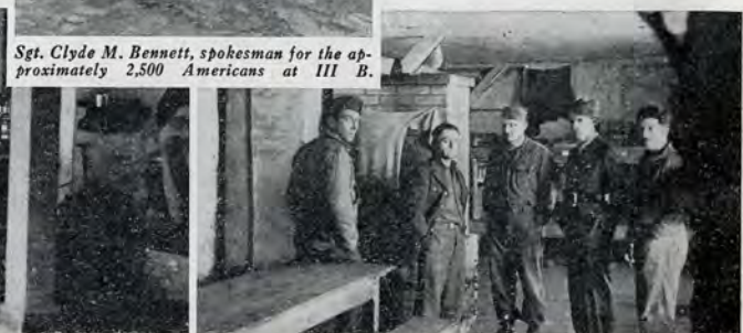
Spokesmen and assistant spokesmen of Work Detachments Nos. 2, 3, and 4 in their sleeping quarters at Schulen.