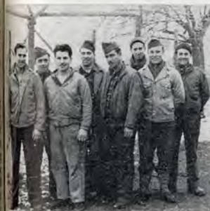
Group of men attached to Work Detachment No. 4.