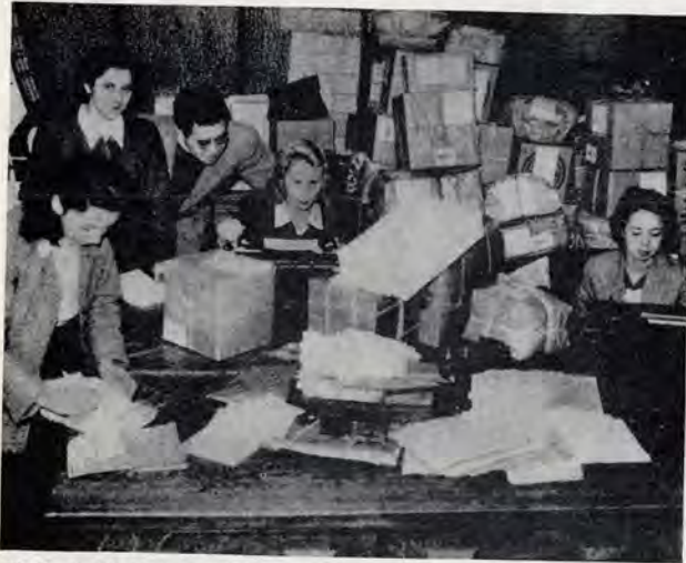
Workers in Shanghai office of the International Red Cross forwarding parcels to civilian internees held in the old U. S. Marine barracks at Haiphong Road.

Food covers have been suggested by repatriated prisoners of war as useful and inexpensive items to include in next-of-kin parcels. Pieces of gauze or mosquito netting or small cotton napkins would meet the need. Incidentally, these small pieces make good fillers for the loose space in next-of-kin parcels.