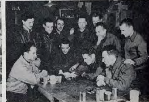
Prisoners study model planes made in the camp.