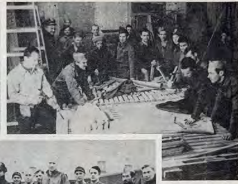
Backstage in the new theater. Wood from Red Cross boxes and camp-made tools are used in making props and scenery.