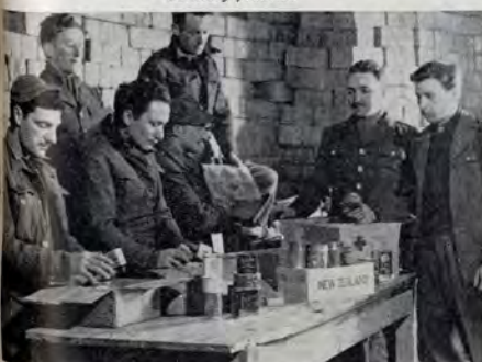
Examining New Zealand and American Red Cross packages in the Vorlager.