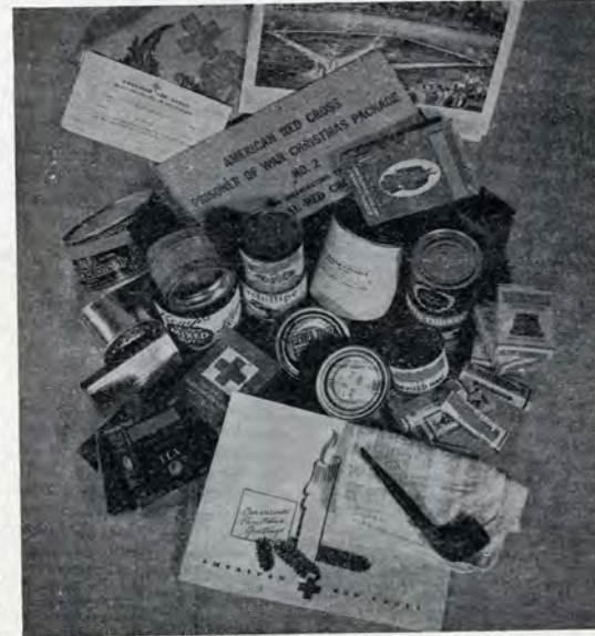
Contents of the 1944 Christmas package for American prisoners of war and civilian internees in Europe. More than 75,000 of these packages were shipped from Philadelphia.

The packages were paid for by the United States government, and the contents in large part were purchased through the Department of Agriculture.