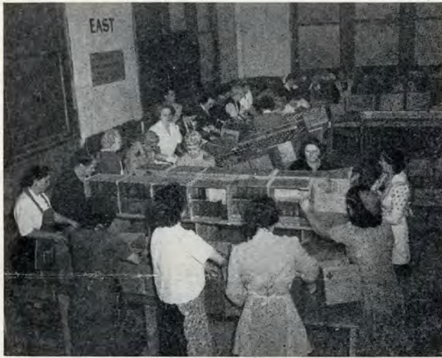
The new packaging center at Brooklyn, N. Y., which began operations on September 11. Since this photograph was taken, the volunteers have obtained their regulation blue smocks.