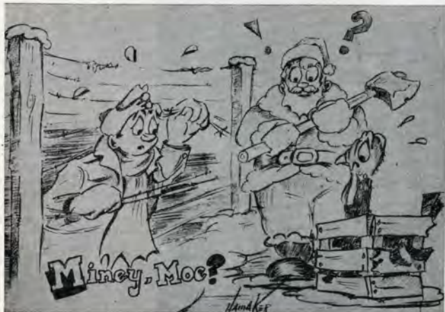
Christmas thoughts at Stalag Luft III. Another cartoon for Prisoners of War Bulletin from Lt. Leonard E. Hamaker, South Compound.

The camp storehouse had been destroyed during a bombing raid, and 500 Red Cross packages lost. Air