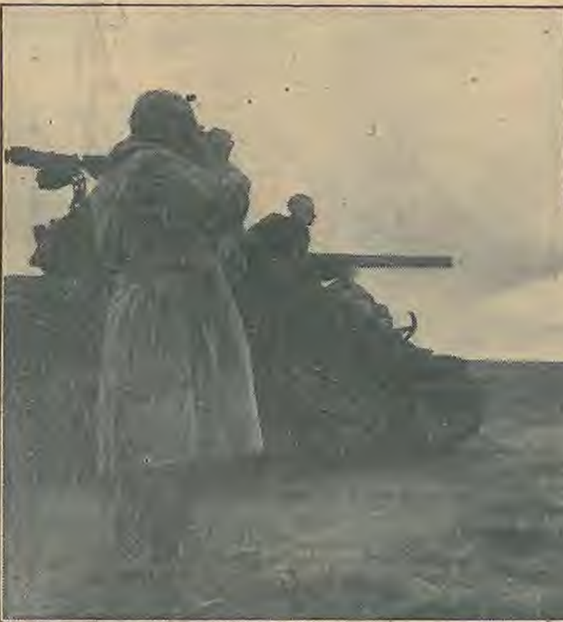
Lt. Gen. George S. Patton records on his own movie camera a demonstration by flame-throwing tanks. These weapons were used effectively by the Third Army in closing the ring around Metz.