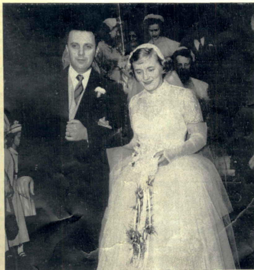
HEALTH AND HAPPINESS FROM THE GANG