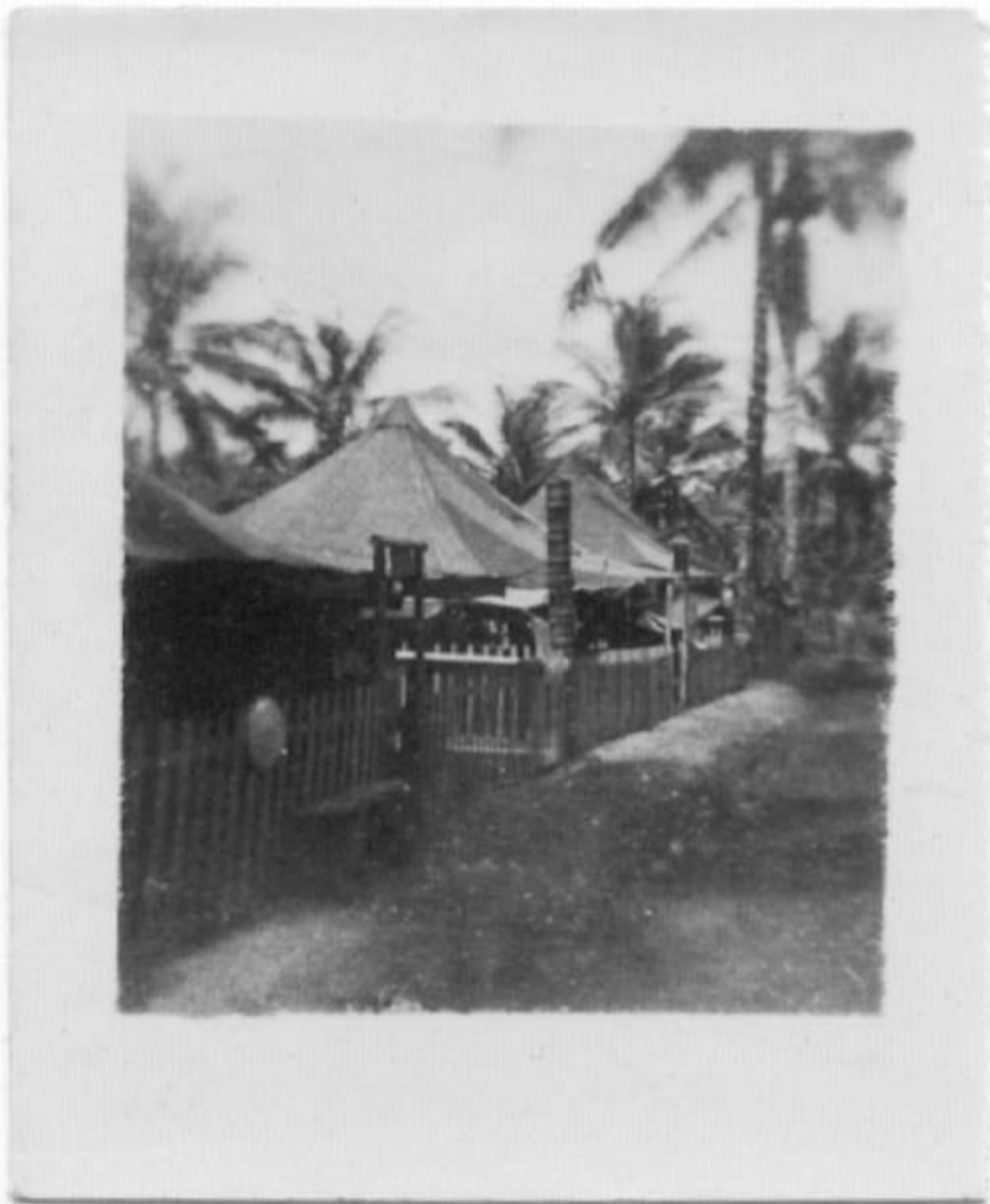
COMPANY HEADQUARTERS TENT