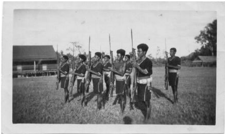
NEW GUINEA SOLDIERS - TRAINED BY AUSTRALIANS

defended. The enemy had succeeded in moving two Divisions with Artillery into attack position without being detected. The attack came as a complete surprise to our Generals as well as everyone else. The defense line ran about five miles along the river from the ocean to the mountains. The Japs, as was their custom, did not attack the entire line but concentrated on a few hundred yards section with wave after wave of suicide charges. Despite heavy losses they continued these attacks and were successful against this section of the defense line. Our troops had to withdraw as they ran out of ammunition. The Japs had successfully completed the first part of their plan and had many soldiers "behind our lines" where they were capable of wreaking havoc among us. Including attacking our river line from the rear, plus supply lines, communications, Artillery and anything else they could find. With all these enemy troops "behind the lines" it behooved everyone to be extremely wary of any unusual activities one might encounter. They were back there with one purpose, to destroy anything that they came in contact with.