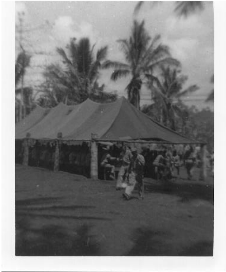
MESS TENT ON MOROTAI

Our camp situation on Morotai was a good one including tents with cots. I even bought an air mattress from a sailor, which made that folding cot almost comfortable. By the side of each tent we constructed a pillbox by digging a pit large enough to accommodate six men quartered in each tent. This was covered with coconut logs and sand bags for our protection. A slit was left in order that rifles could be fired in the event of a ground attack. Enemy air raids were always at night. At the sound of an air raid alert we came out of the tents and sat on top of our pillboxes while watching the searchlights pick up enemy bombers and the Anti-Aircraft firing at them. Our fighter planes could intercept the enemy bombers before they arrived over the island or go after them when they left. While over the island our defense against them was left to the Anti-Aircraft guns and their bursting shells would hit any plane up there, whether friendly or enemy.