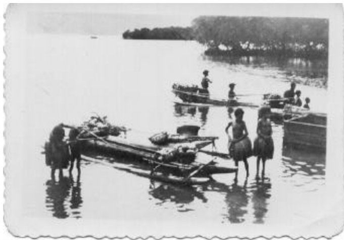
NEW GUINEA NATIVES & THEIR BOATS

with it's estimated 50,000 to 75,000 men, which included possibly 25,000 first line combat troops. These daring operations, deep into once held enemy territory, were a success and effectively isolated all these Japanese troops at Wewak. The Navy and the Army Air Force were in control of the Sea and the Air thus blocking the Japs from receiving further supplies or reinforcements. The Japanese General decided that while he still had combat effective troops and some supplies, to attack the American troops deployed along the Driniumor River which was the outer defense of the Aitape base a few miles to the west. It would seem that his plan was to break through this line of our defense and destroy these troops. Then move on to the Main Line of Resistance (MLR) east of Aitape, destroying it as well as the Air Strips. Then on to Hollandia in hopes of joining up with other Jap forces and finding a means of acquiring supplies.