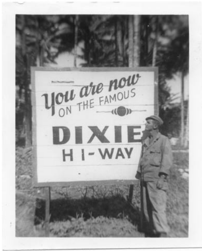
PAUL TILLERY AND THE MOST PHOTOGRAPHED SIGN IN THE SW

stealing food from our kitchen tents and also rumors of them watching our movies. I think the part about them stealing food is correct but I'm not so sure about the movies. Besides the air strip, the Japs bombed the docks occasionally but with less damage. Our trucks were used mostly to haul supplies from the docks to supply dumps and to our units on the defense line, as well as in camp areas. Morotai is a very small island and we only took part of it, thus everything was nearby. Things we missed from the States were salads, fresh vegetables, ice cream and Coca-Cola. We did have Coca-Cola once that I remember.