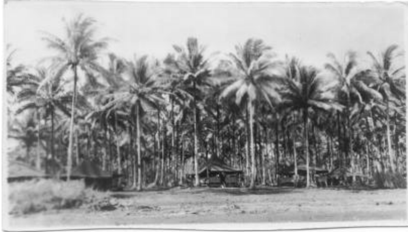
A CAMP AREA ON MOROTAI