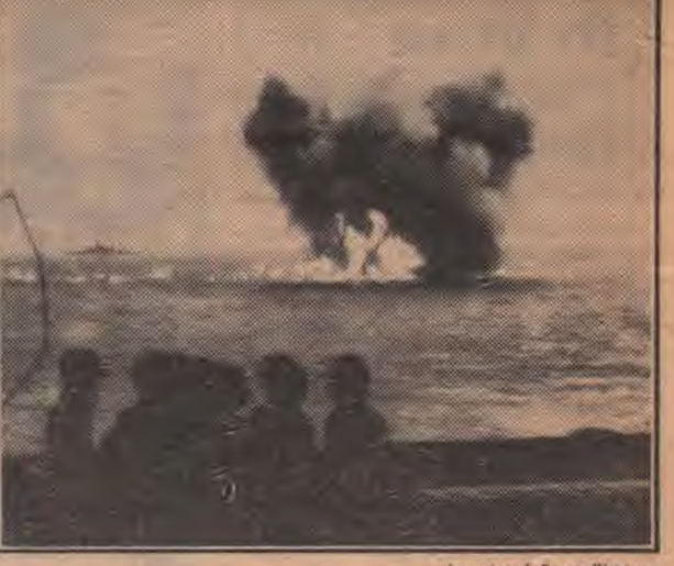
A BANZAI AIR CHARGE ENDS UP IN THE DRINK: In this vivid sequence of pictures, a Japanese "suicide" plane, recently disclosed to be pilot-guided rocket bombs directed against Allied fleets in the Pacific, attempts unsuccessfully to dive on the deck of an aircraft carrier. Left, the plane rolls over on its back under a hail of gunfire. Center, hit by ship's lire, the plane belches flame as it passes close to the U.S. ship, Right, a mass of burning oil spreads over the sea as the "suicide" is completed, with the plane crashing within 400 yards of the ship (in foreground).