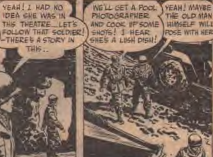
'MISS LACE THAT

DID NOB YEAH - OVER BY THE MESSAGE MISS LACE? CENTER - CAN'T NOW HOLD ONTO