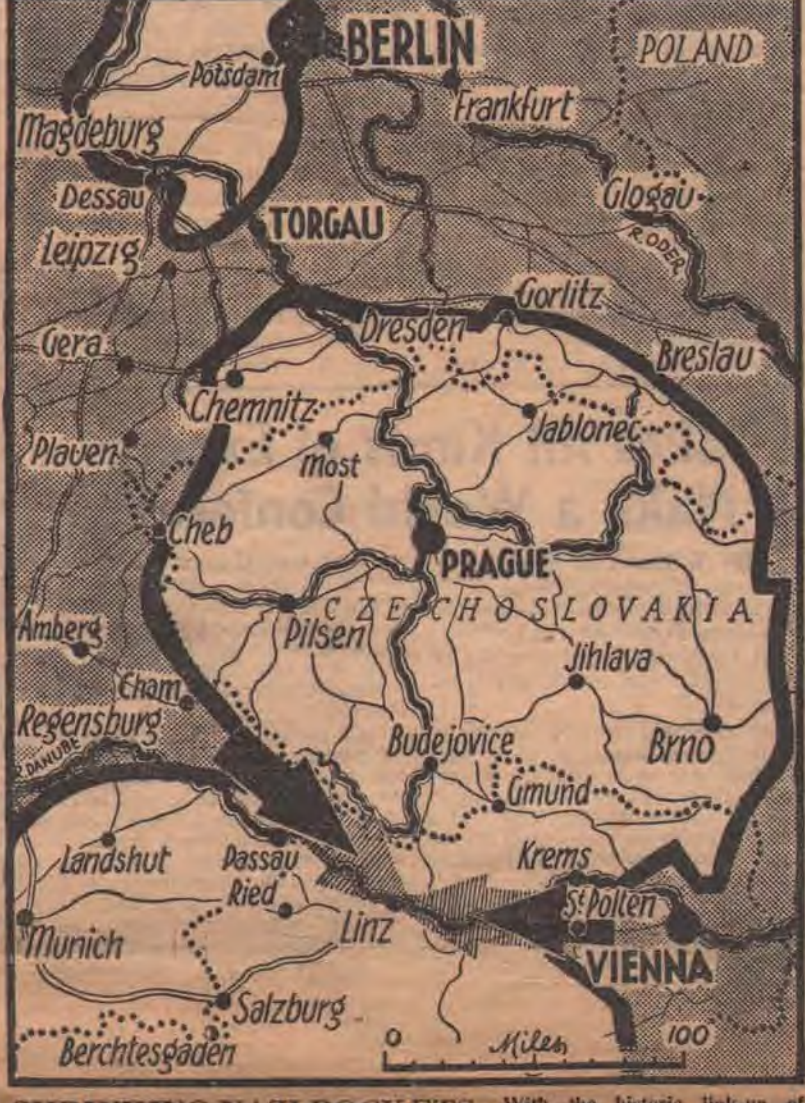
SHRINKING NAZI POCKETS: With the historic link-up of American dad Soviet troops forged at Torgan, Nazi pockets of resistance were dwindling last night. Red troops were clearing Berlin, while the U.S. 3rd and 7th Armies drove toward Hitler's southern redoubt, with the 7th entering Munich.