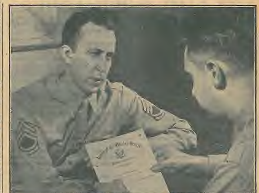
A discharged vet now begins the job quest.

"The magnitude of the task," he said, "is indicated by the fact that more than 12,000,000 workers have been added to the payrolls, that half of the 62,000,000 persons in the labor force are directly in war work and that there has been a displacement of workers in industries and occupations as well as a geographical displacement which breaks all migration