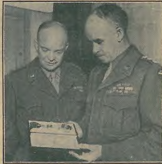
6.—Gen. Omar N. Bradley shows Ike award given him by King of England. What's the award? (a) Order of Suvorov (c) Iron Cross (b) D.F.C. (d) Knight Comm. of Bath