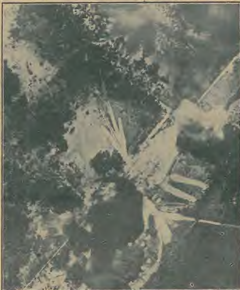
This is an aerial view of one of the many softening-up raids by American carrier-based planes upon Japanese installations on the Philippines prior to the landings on Leyte Island. Enemy supply dumps are shown going up in smoke. Many airstrips were crippled by the attacks.