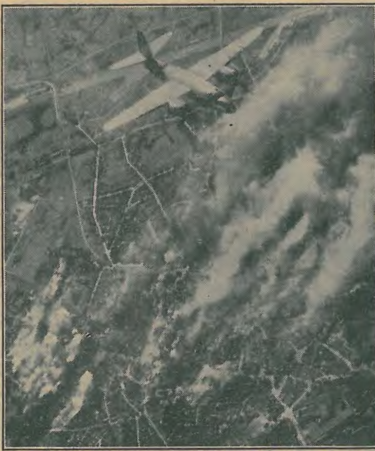
1.—An American plane turns home after doing its share in pounding the strategic Hengelo Railroad yard, 40 miles northeast of Arnhem, Holland. What plane is it? (a) P-51 Mustang (c) Flying Fortress (b) Marauder (d) Corsair