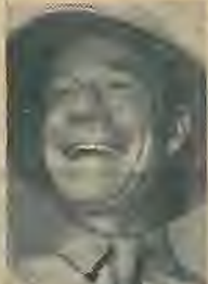
JOE E. BROWN

A Navy man said he felt the same way about it. "I saw Old Barrel Mouth stand in a tropical rain soaked to the skin to amuse a group of Negro Sea Bees, and that show wasn't on his schedule. He had taken the day off to get down to see these boys. The Navy is for Joe, and tell that to the Army critics."