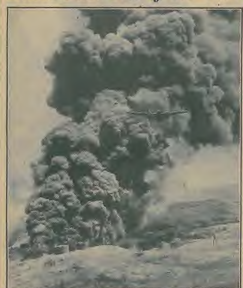
An A20 Havoc of the U.S. Fifth Air Force starts for home after blasting an oil-storage plant at Boela on the Island of Ceram in the Netherlands East Indies.