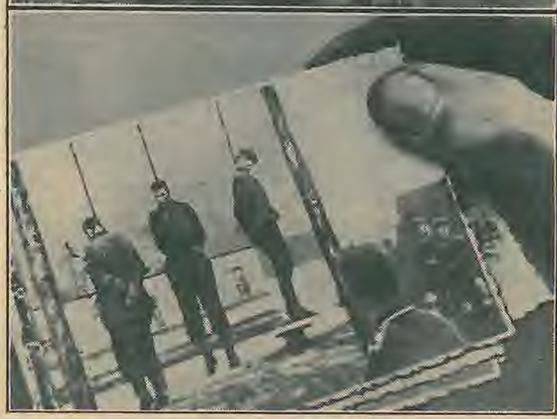
A Russian soldier, making a routine search through the pockets of a German killed in action, discovered a photograph showing three men, obviously Russians, hanging by their necks from a Nazi scaffold. These pictures were included in March of Time's "One Day of War,"