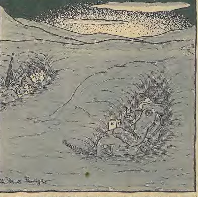
"Whattya complainin' about? You never had breakfast in bed in civilian life, did you?"