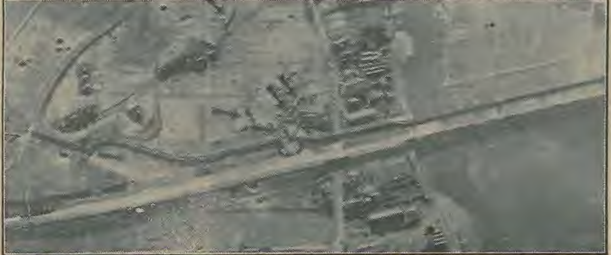
Eighth Air Force Liberators, bombing by instruments through clouds, blasted an 85-foot gap last Thursday in the Mittelland Canal at Minden, near Hanover, cutting Germany's most important waterway over which war supplies flow between Berlin and the Ruhr. Six barges (some shown by acrows) were tossed hundreds of feet onto dry land by the Oct. 26 attack, which drained the canal for 2½ miles.