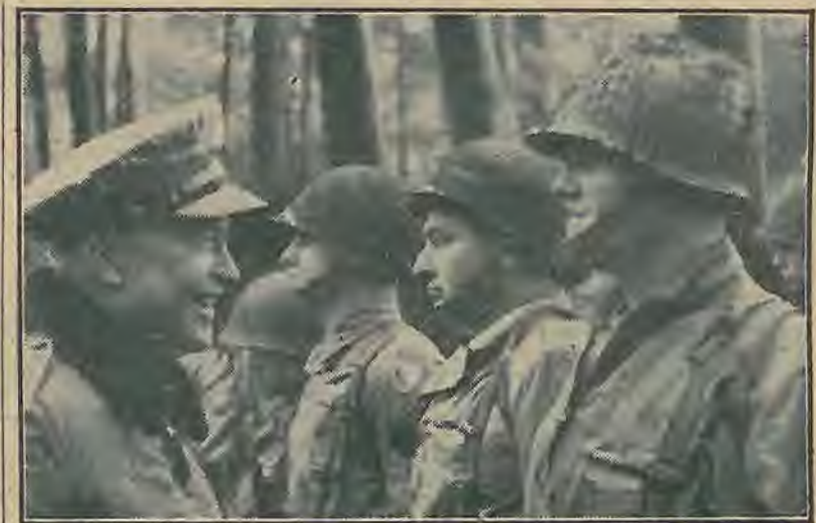
On inspection tour of front, Gen. Eisenhower chats with burly soldiers.

Eisenhower inspected American installations Wednesday afternoon with army and corps commanders. It was the second week of his whirlwind tour through France and Germany.