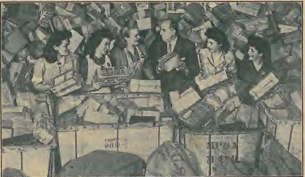
In case you're still wondering, here are some of the 123 carloads of gifts for men overseas that piled up in New York's postoffice. Gentleman in the photo can quote, "Nor wind, nor rain, nor snow, nor gloom of night can stay these couriers from their appointed rounds" at the drop of a stamp. He's the fellow in New York through whom they write in c/o.

Drum Gets High Post NEW YORK, Nov. 16—Lt. Gen. Hugh A. Drum, who retired from the Army last year, will succeed the late Alfred E. Smith as president of Empire State, Inc., which operates the world's tallest building. Drum will keep his post as commander of the New York Guard.