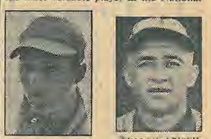
DUTCH LEONARD FRANKIE FRISCH

baseman, is now the ace right-hander of the Cincinnati Reds. Bucky was named the most valuable player in the National