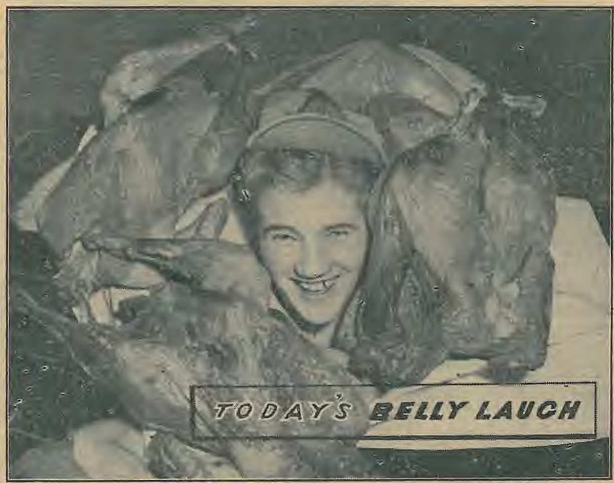
TODAY'S BELLY LAUGH

Meanwhile, cigar stores throughout the country were displaying "No Cigarettes Today" signs in an effort to help in giving the troops an extra smoke. Civilians appeared willing to bear the shortage when they thought it was caused by the extra demand for smokes by the men in the services, particularly those at the front, but neither civilians nor soldiers had them.