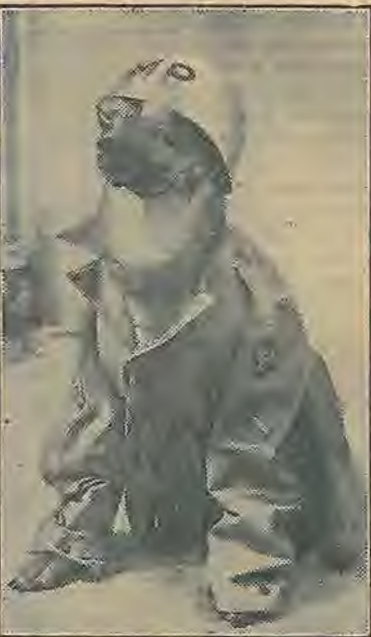
He won't wear the uniform but it's indicative of the work he'll do. Both RAF and US MPs are training dogs as guards for airfields in the U.K.