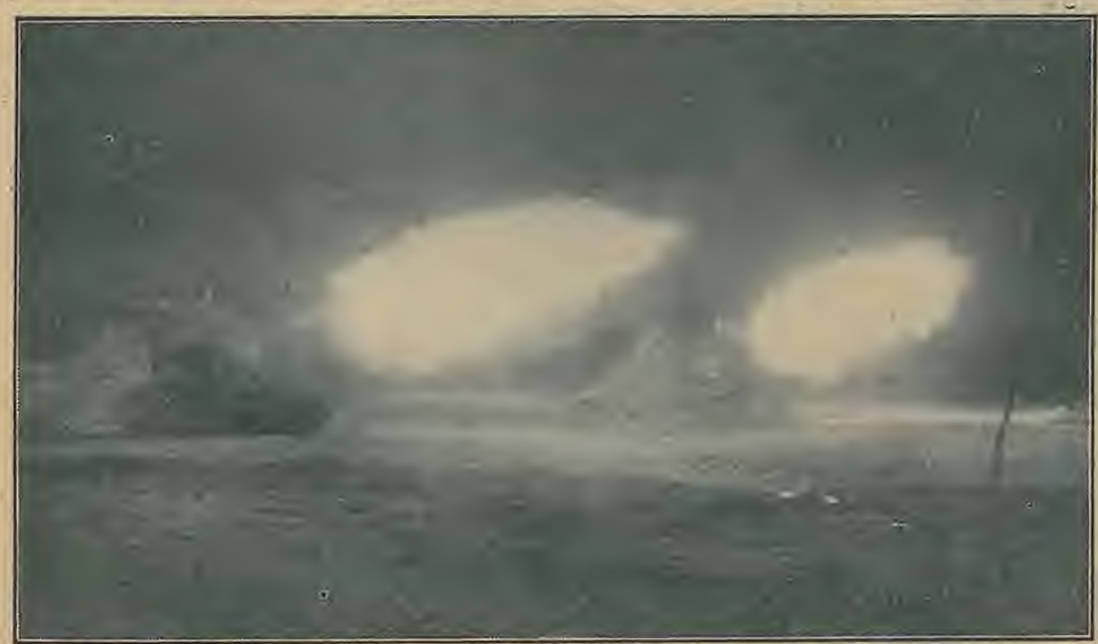
In the blackness of night combat the muzzle flare from M-4 tanks lights up the sky as they fire from Luxembourg into Germany in support of divisional artillery.