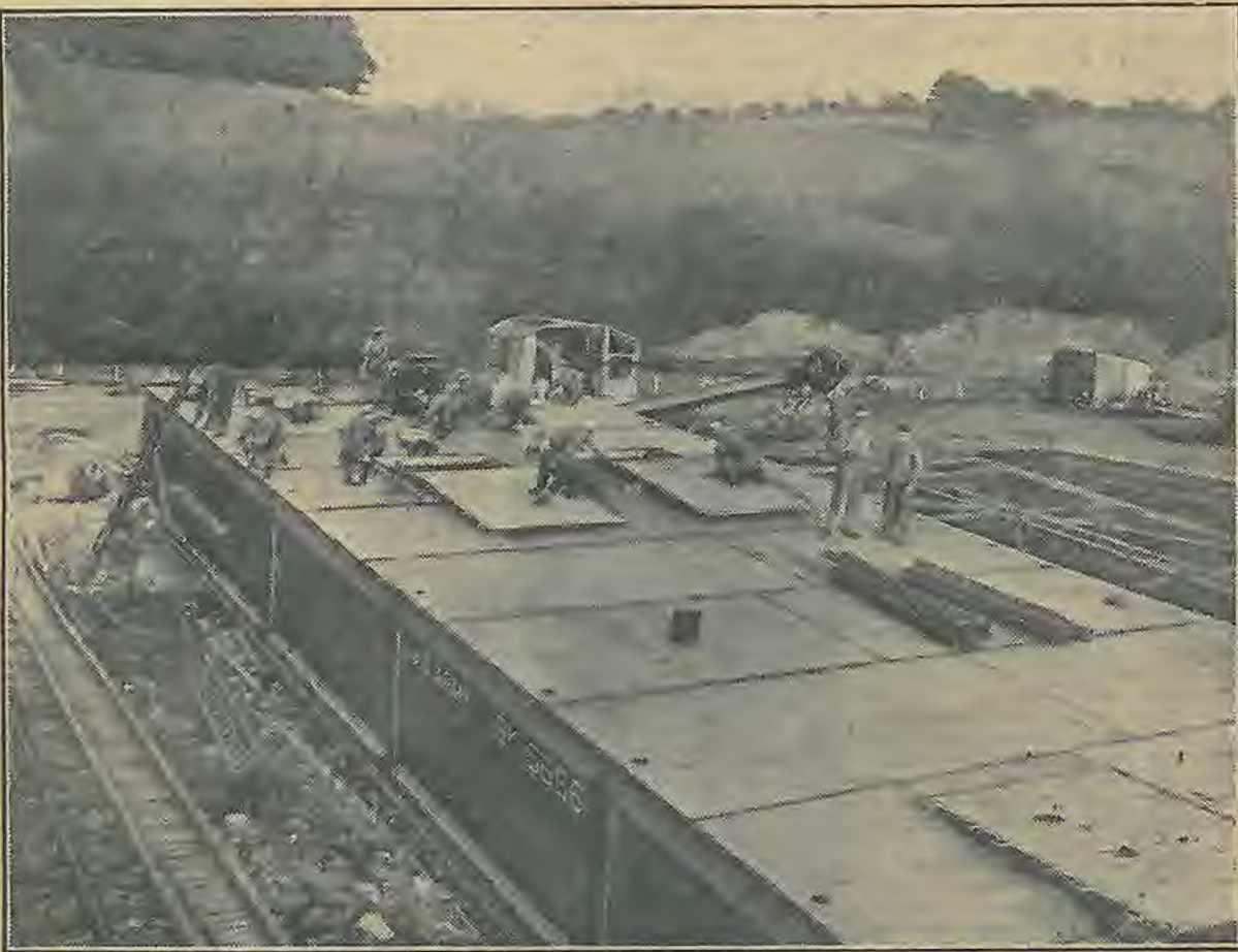
This huge barge, which, on completion, will be towed across the Channel for use in the vast inland waterways system on the Continent, gets the finishing touches from Transportation Corps GIs in England. The steel craft weighs 125 tons, is over 100 feet long, 30 feet wide and 10 feet high. Five are completed every 3½ days.