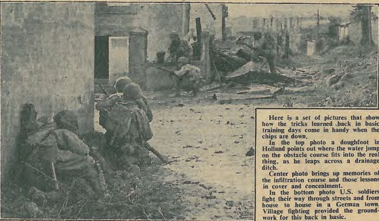
Here is a set of pictures that show how the tricks learned back in basic training days come in handy when the chips are down. In the top photo a doughfoot in Holland points out where the water jump on the obstacle course fits into the real thing, as he leaps across a drainage ditch. Center photo brings up memories of the infiltration course and those lessons in cover and concealment. In the bottom photo U.S. soldiers fight their way through streets and from house to house in a German town. Village fighting provided the groundwork for this back in basic.