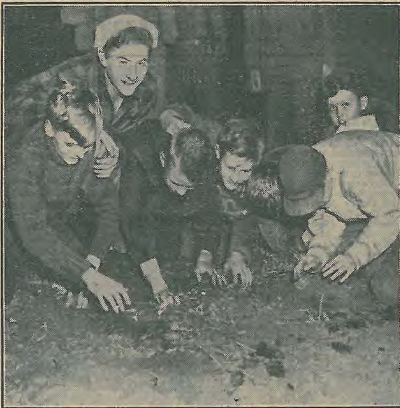
Here's another commotion caused by the radio program "Truth or Consequences." When a participant was told he could have $1,000 buried at a certain spot in Holyoke, Mass., the good citizens of that Berkshire town fell out to beat him to it. Here some dig in vain for the treasure.