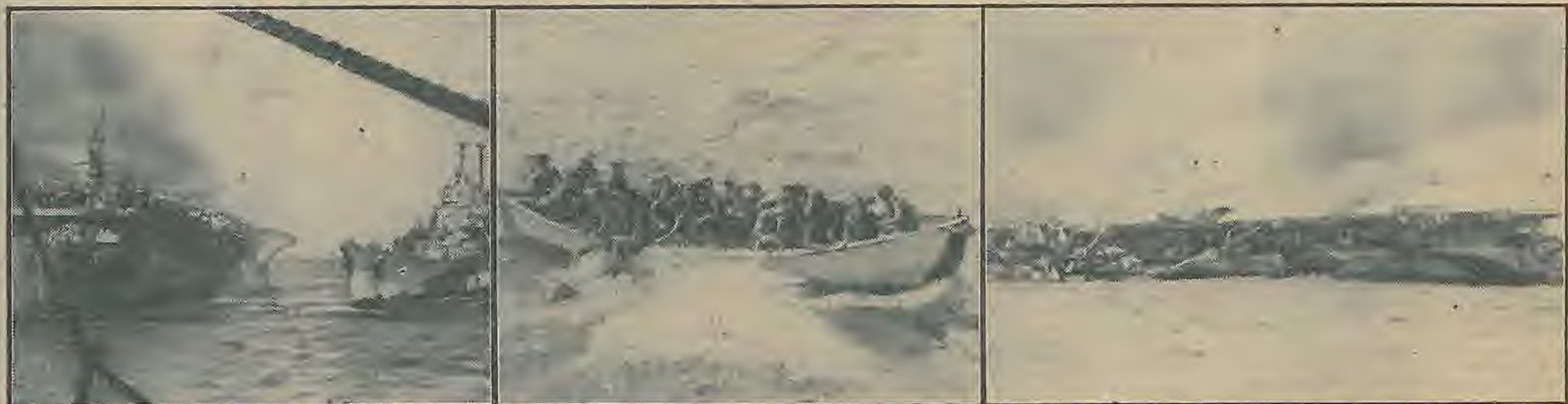
Here are three photos of the last moments of the carrier Princeton, one of the six U.S. ships lost in the air-sea battle off the Philippines last month. In picture on left, a cruiser pours streams of water into the burning ship, while its lifeboats probe around for survivors. Center, an overcrowded lifeboat, its wet and oily occupants working hard to empty it of water, moves back to the cruiser. Right, a destroyer arrives to pour water on the carrier. Until fire exploded the ship's magazine, there was hope of saving her, but the explosion was so violent the crew had to abandon ship. Of nearly 1,300 officers and men aboard, almost all were saved, although many were forced to stay in the water several hours.