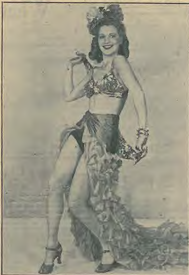
If you've still got room on the hut wall, here's one of actress Julie Bishop giving out with some kind of terpsichorean routine. Nice smile.