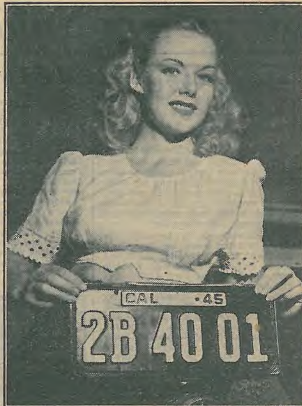
California motorists will have new license plates for 1945, it says here, done in a "fashionable black and white." Displaying the decorative strip of metal is Angela Greene, Hollywood starlet.