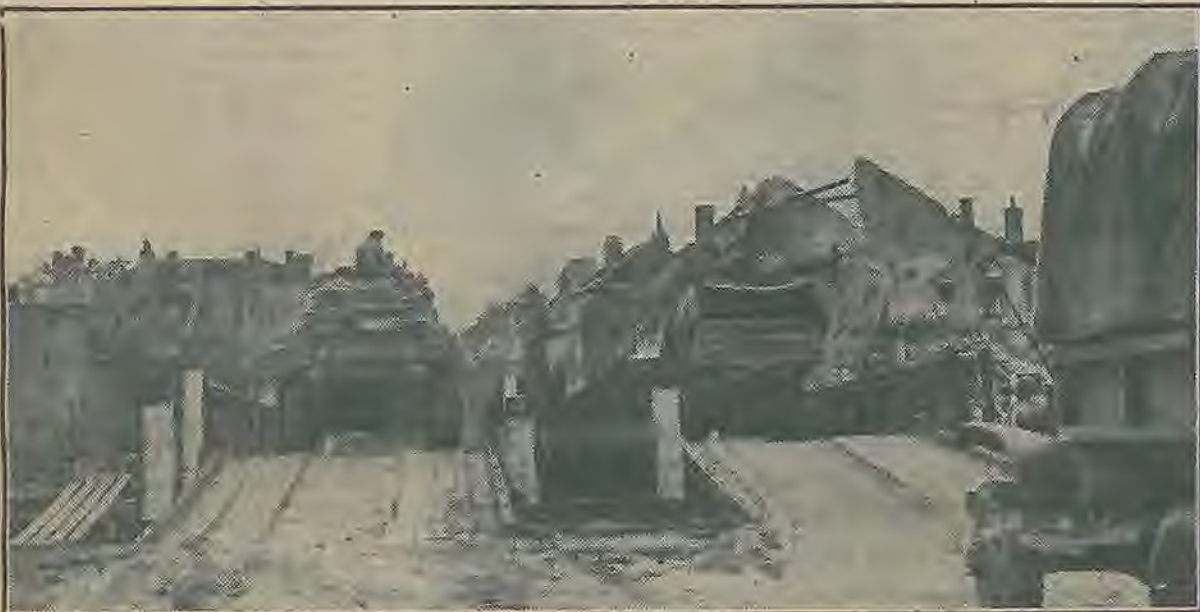
Men and machines of the Seventh Army move swiftly toward Strasbourg, leaving German positions in condition of a well-battered football line. Top photo shows a U.S. patrol investigating wrecked German vehicles near Saverne. Below, tanks rumble over a bridge in devastated Blamont.