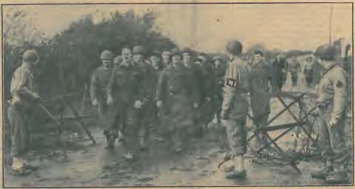
Their faces alight with relief at the sight of American MPs, these Allied soldiers march back from a Nazi prisoner-of-war stockade in an exchange of prisoners in the St. Nazaire sector, France. Nineteen Americans, 30 French and three British warriors were released in return for 54 of the enemy.