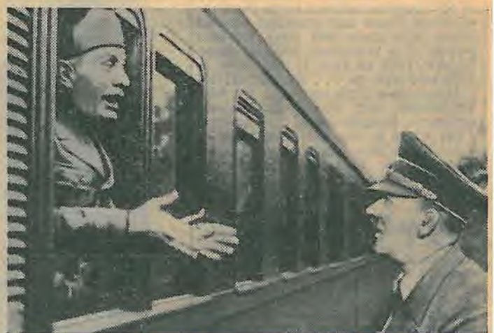
1—"I gotta bigga idea," Musso must have said to Adolf, soon after the bomb attempt on the fuhrer's miserable life. "Let'sa getta outa the war." Adolf has been reported? A—Dead B—Crazy C—Sick D—Myth