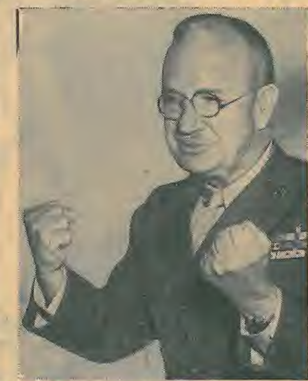
HOWLIN' —When Lt. Gen. Holland M. Smith makes a point he does it with two-fisted emphasis.

Fleet Marines Love Their Pacific Boss, Who Loves a Fast Fight