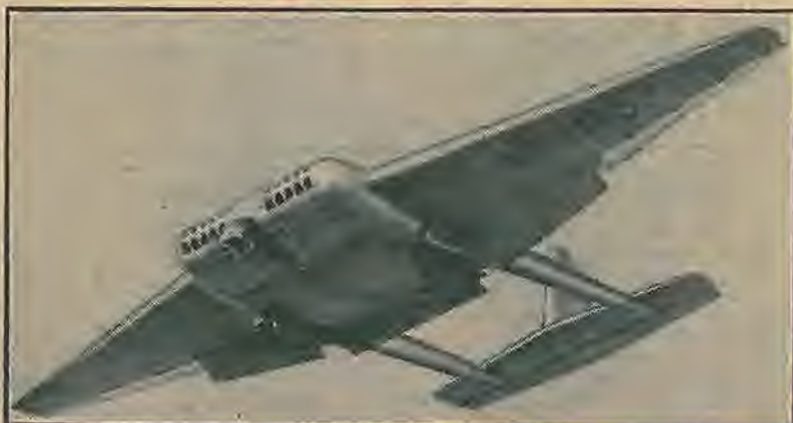
This is the U.S. Army Air Forces' newest-type glider, to be used in combat and invasion operations. The nose grill is the intake of a series of air vents, designed to decrease wind resistance.