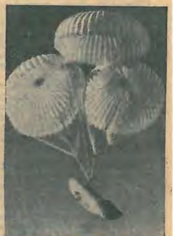
3—The latest in life-saving equipment—an airborne lifeboat, which can be dropped from a B17 bomb bay. Powered by two 5 h.p. engines, it can do 8 m.p.h. Chutes can be used as? A—Napkins C—Anchor B—Blankets D—Beacon