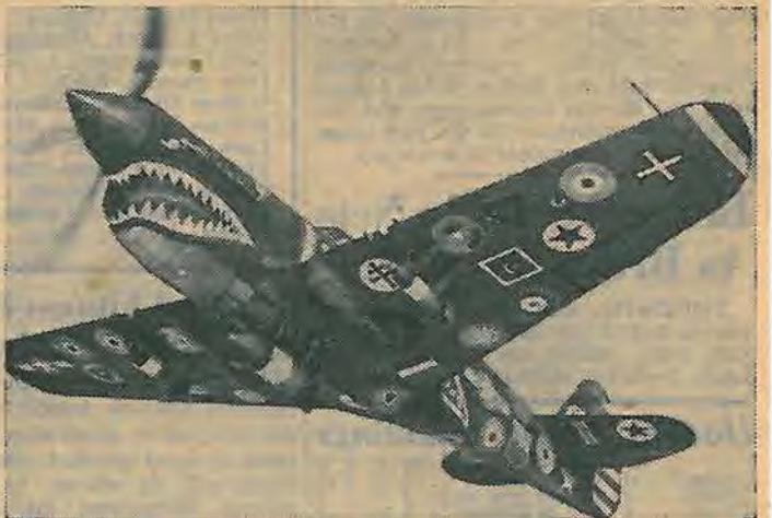
4—This Curtiss-built fighter—the 15,000th of its type to roll off the Buffalo assembly line—carries the insignias of all 28 Air Forces. Type? A—B29 B—P40 C—P39 D—A20