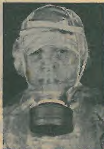
2—The latest in gas masks. Designed especially for hospital patients with head wounds, the mask was developed by the Chemical Warfare Service for use in forward areas. In canister? A—Chemicals C—Butts B—Candy D—Gum