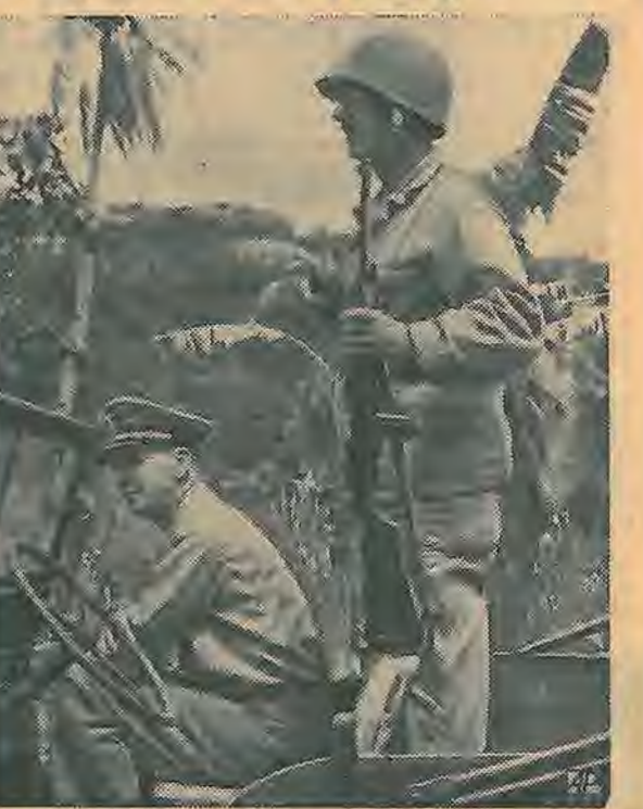
GUNNIN' —Gen. Smith takes Adm. Ernest J. King on a tour of Saipan, and as usual he totes his gun with him.

"Knowing that a sitting target is easier than a fleeting one, the Marines have sacrificed armor for speed and mobility. "When you're boxing with another man you don't let him