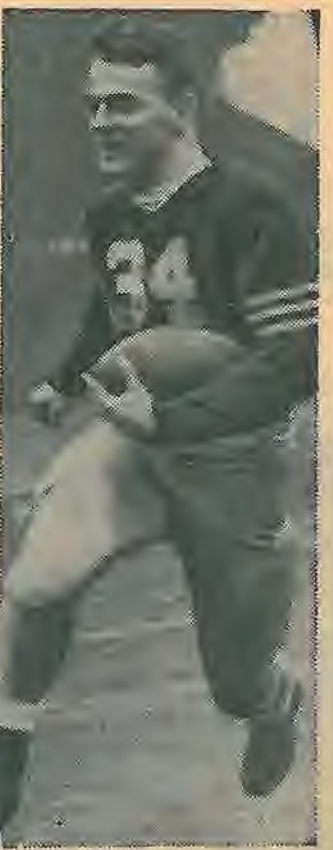
GLENN DAVIS Army Back