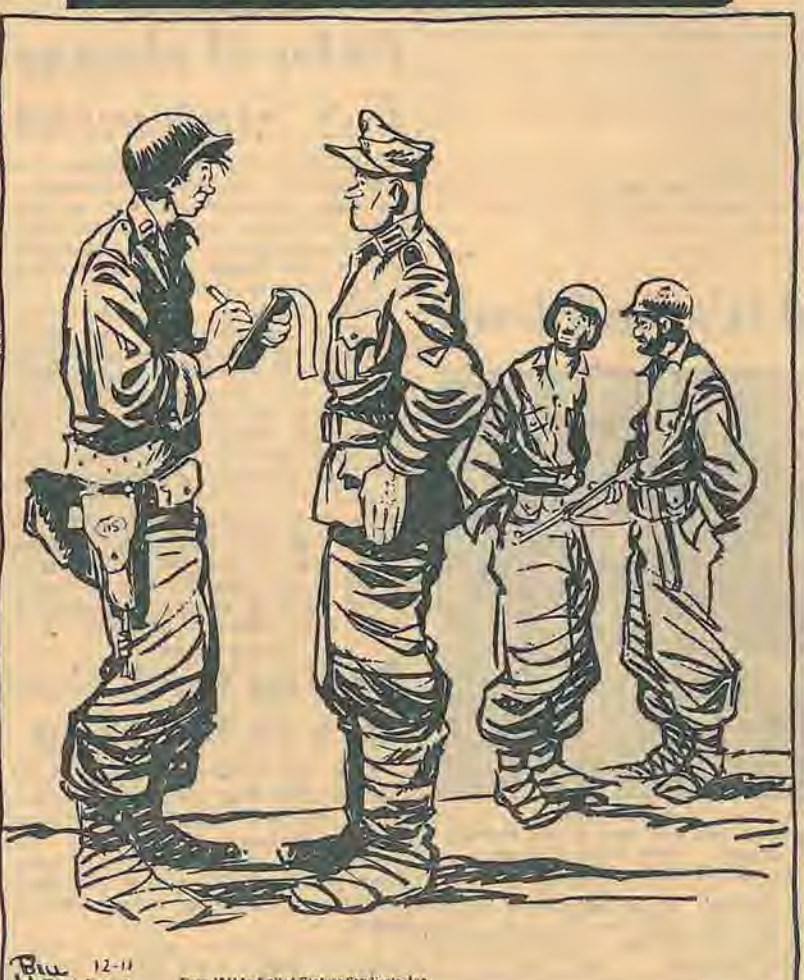
"Tell them prisoners to ack sloppier in front of th' lieutenant. He might start gittin' ideas."