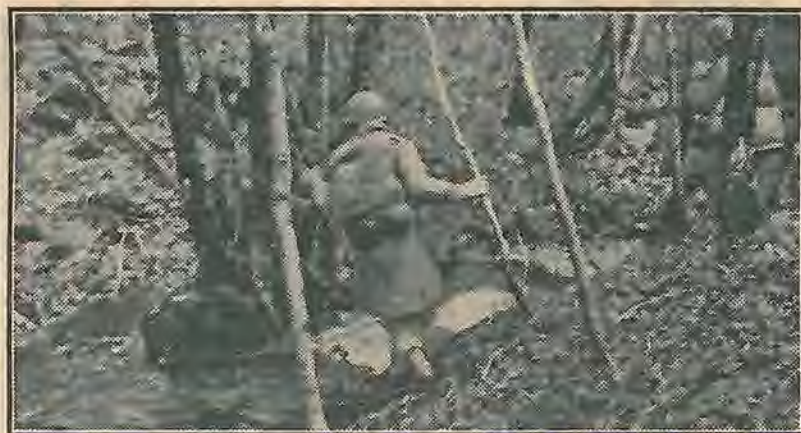
In the Wissembourg Forest, north of Climbach, the first men of the Seventh Army enter Germany by crossing a small stream. Thus, without drama or fanfare, the Fourth American Army entered Hitler's Reich.