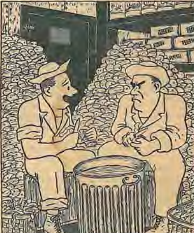
"I know what I'm gonna do—Raise a lot of spuds?"