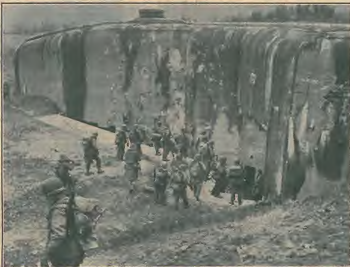
Troops of the Seventh Army gather before a huge Maginot fort near the German border north of Climbach. One in foreground, with K-rations, looks for a quiet place for lunch. Shortly after this photograph was taken the doughboys struck out through the Wissembourg Forest and entered the Reich.