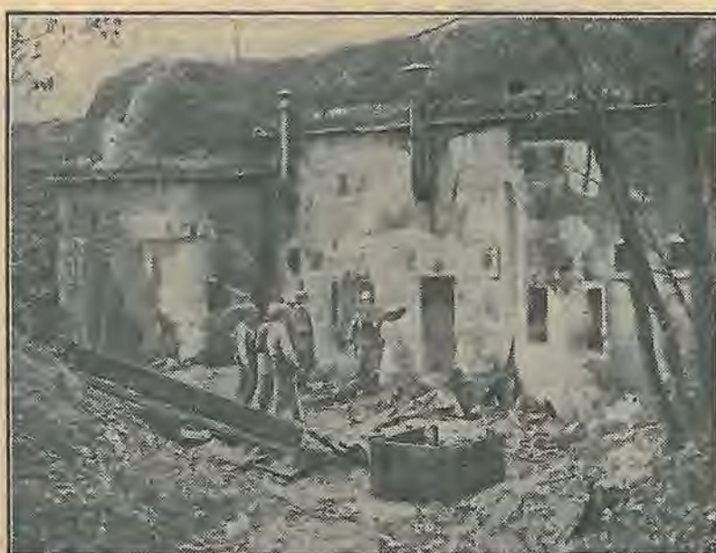
THIRD U.S. ARMY doughboys examine battered defenses of German fortress of Koenigsmacher, 20 miles north of Metz. Community diggers helped prepare strongpoints like this.