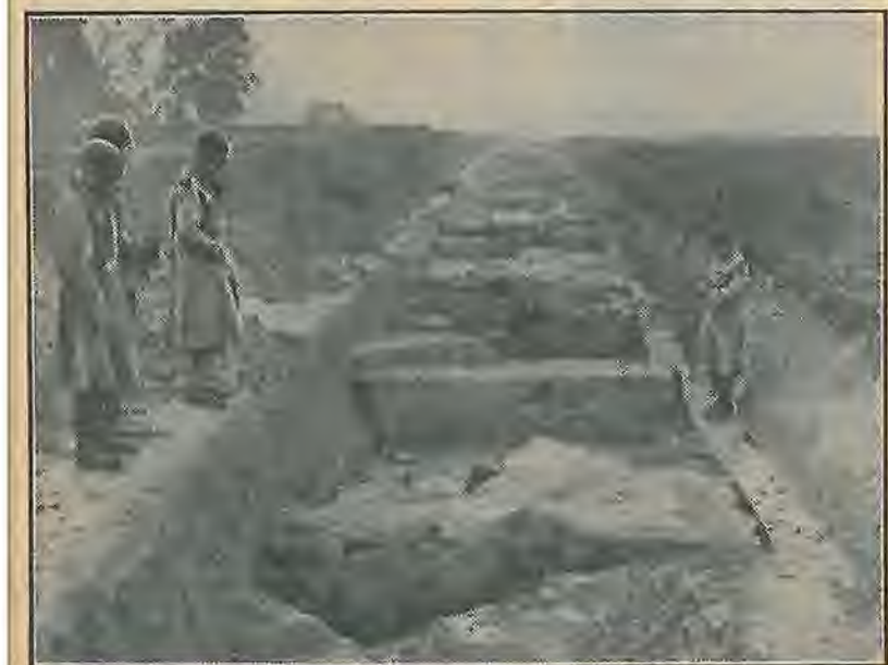
WEST OF WURSELIN Hitler's women and children dug these anti-tank ditches in bulge of Siegfried Line before they fled in front of American armor that crashed through.