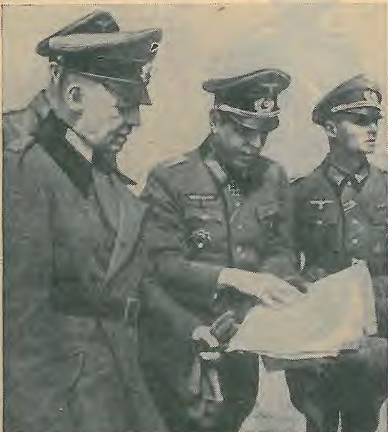
Here are four shots of two German generals whose military gambles may have been similar. The world awaits the answer as America's doughboys slug it out with the Wehrmacht. Top, Erich von Ludendorff, the World War I character. (Below) Gerd von Rundstedt, present field marshal of German forces on the Western Front. (Right) Ludendorff is pictured with Prince Heinrich of Prussia, brother of the ex-Kaiser.

In the early hours of Nov. 7 a message came through from Germany stating that her envoys would like to pass through the lines and sue for an Armistice.