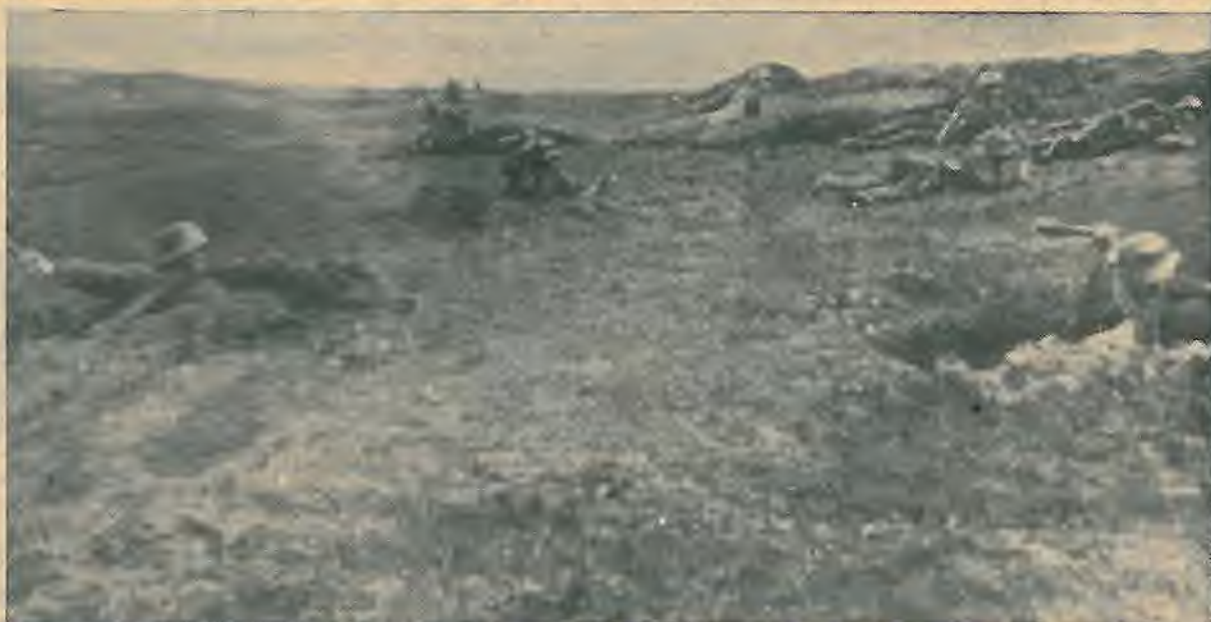
FINAL GERMAN OFFENSIVE of World War I was launched March 21, 1918. It was a showdown bet and Gen. Erich von Ludendorff lost.

H OLLOW-EYED Field Marshal Gerd von Rundstedt, once given the boot by Hitler because of "inefficiency," turned loose his legions a week ago in the Luxemburg-Belgium sector in a sky-high bid to crash the Allied forward line and stretch what appeared to be Germany's last mile into a long, bitter fight.