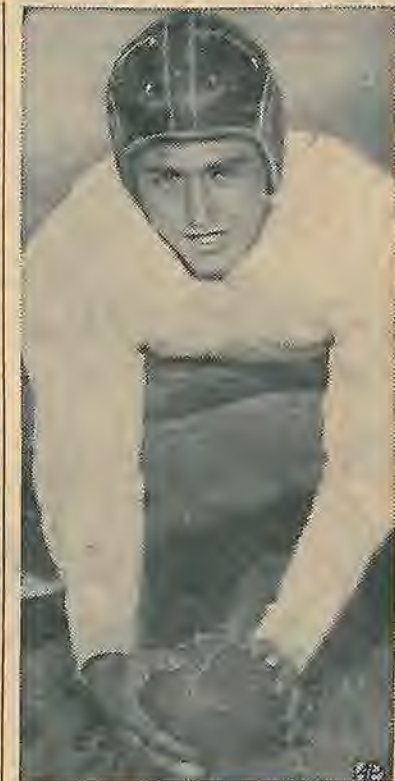
Jim Cooper Horned Frogs' Hustling Center