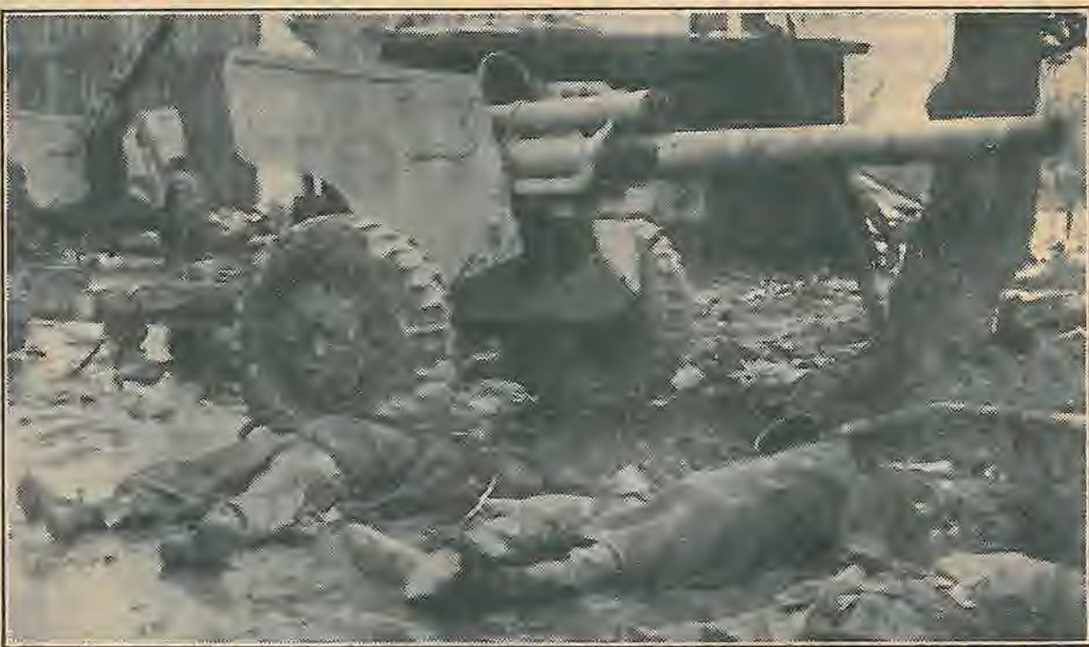
U.S. Army Signal Corps Photo. For those who believed it was "all over but the shouting" here is a grim reminder. Taken from captured German film of the Nazi counter-attack, this photograph shows American soldiers lying dead among their artillery pieces. The equipment will be used again by the Germans. The American soldiers will fight no more.

"Some joker told me all you had to do was stand on a corner and beat 'em off with a club."