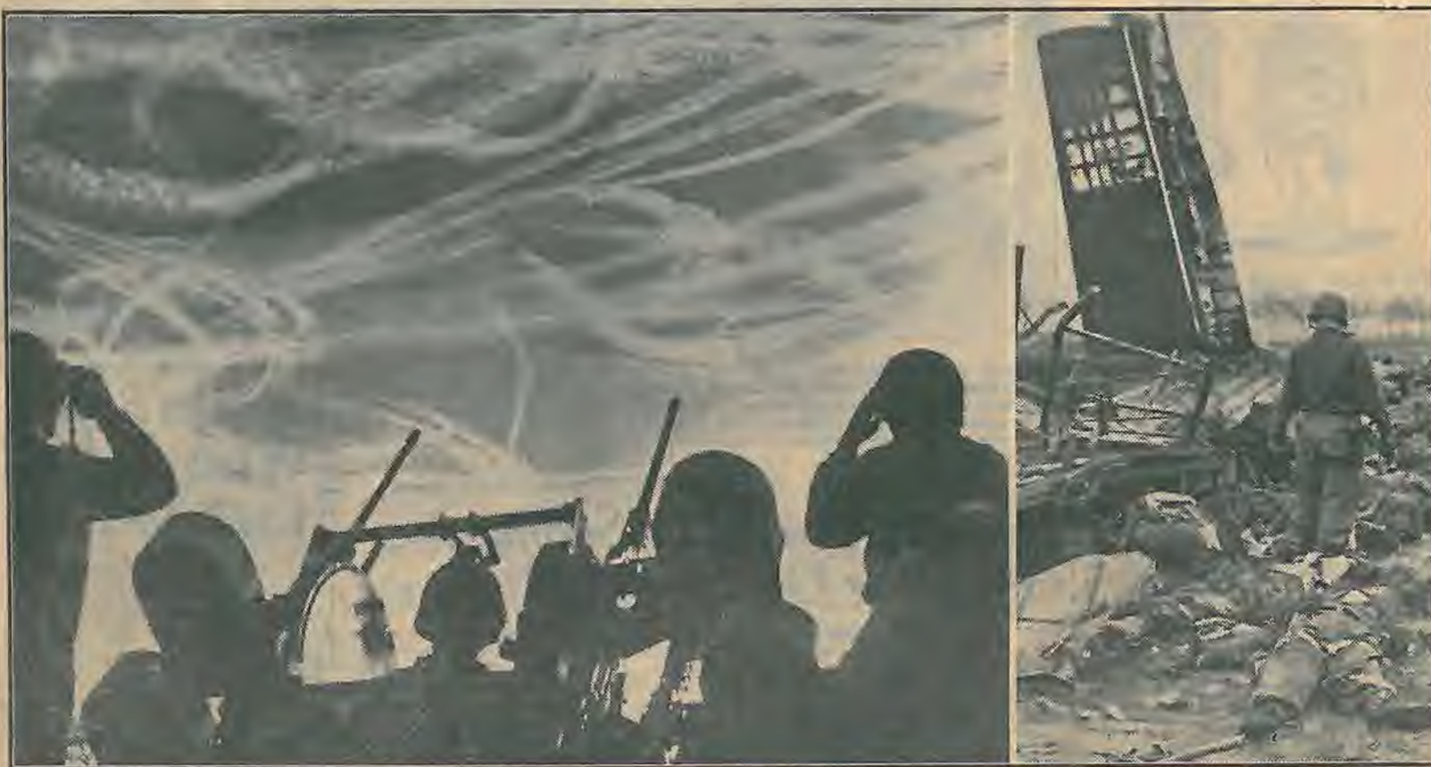
Silhouetted against a German sky streaked with vapor trails left by Allied and German planes engaged in a Christmas Day dogfight, anti-aircraft troops of an M51 battery (left) stand ready to fire their shells against an approaching Luftwaffe fighter. At

American Ground Guns Take Part in a Sky Battle—and Score